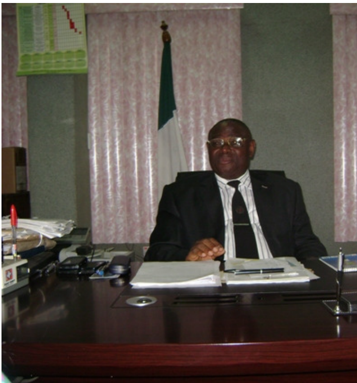
- Chief Judge of Kwara State (Nigeria)