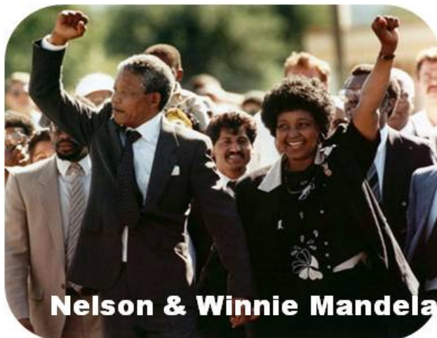
Nelson & Winnie Mandela

What drives simple, ordinary people to wake up one morning and say to themselves, "That's it—this situation can't continue. Something has got to be done, and I am GOING for it"